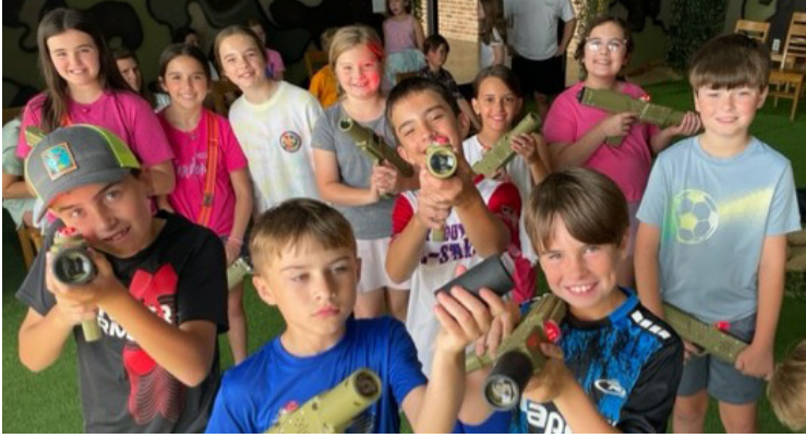
End of the Year Roller Skating & Laser Tag Fun with our 4th & 5th Graders